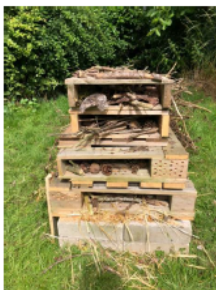
We have recently acquired a 5* hotel – for bugs!

Creativity, spirituality and well-being are the three touchstones of The Hive and they have been the building blocks for our first Summer series which has included outdoor activities with Wild Church, two creative music sessions, an eye-opening walk-about in Great Cressingham and a day to discover the health and well-being benefits of yoga.