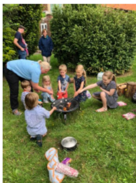
And we have the perfect location for a firepit where plenty of marshmallow-toasting has been happening.