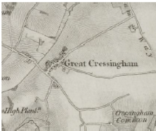
1835 map of Great Cressingham – not much has changed since then!