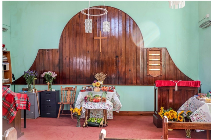
Harvest Festival September 15th