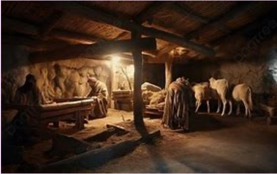
JESUS, MARY AND JOSEPH IN THE STABLE