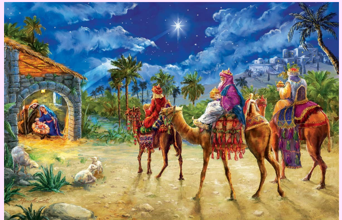
THE WISE MEN