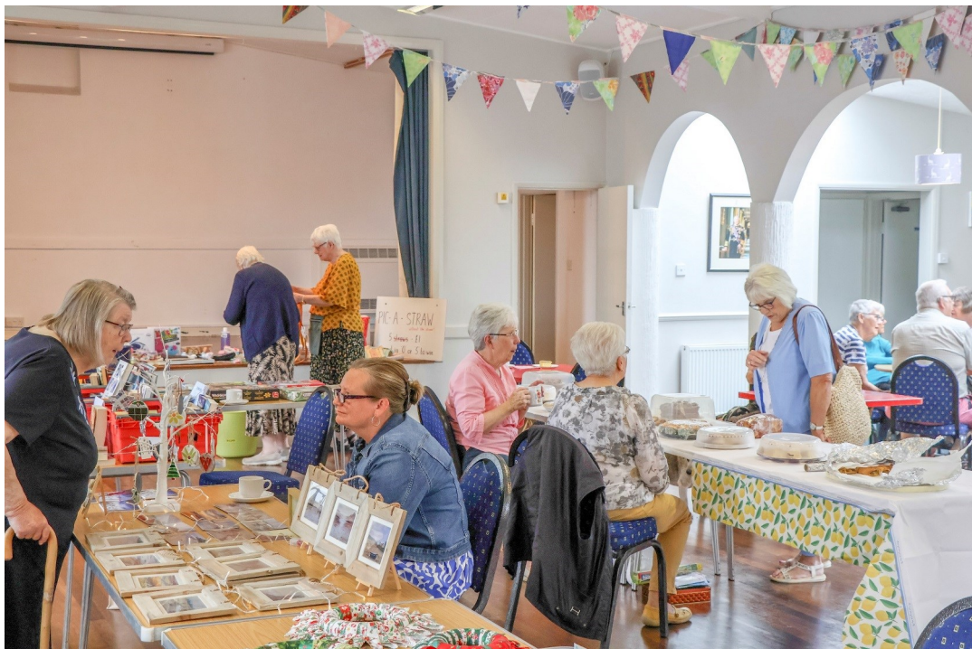
Coffee Morning September 7th.